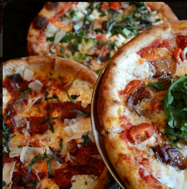
Pasta and Pizza